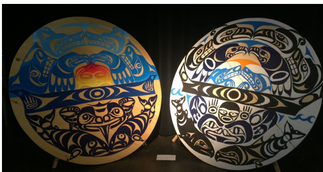
The Finished Paintings

This past school year, Surrey Christian School (SCS) was the recipient of an Innovation Grant from the Innovation Partnership Working Group. The purpose of our innovation grant was to support SCS’s journey of authentically integrating the First Peoples Principles of Learning into our way of being and learning. This grant recognizes that the SCS’s learning on this journey is done on behalf of all the students and schools of British Columbia.