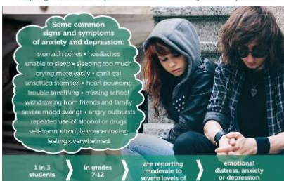
Helping students cope with stress, anxiety and depression