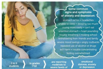
Helping students cope with stress, anxiety and depression