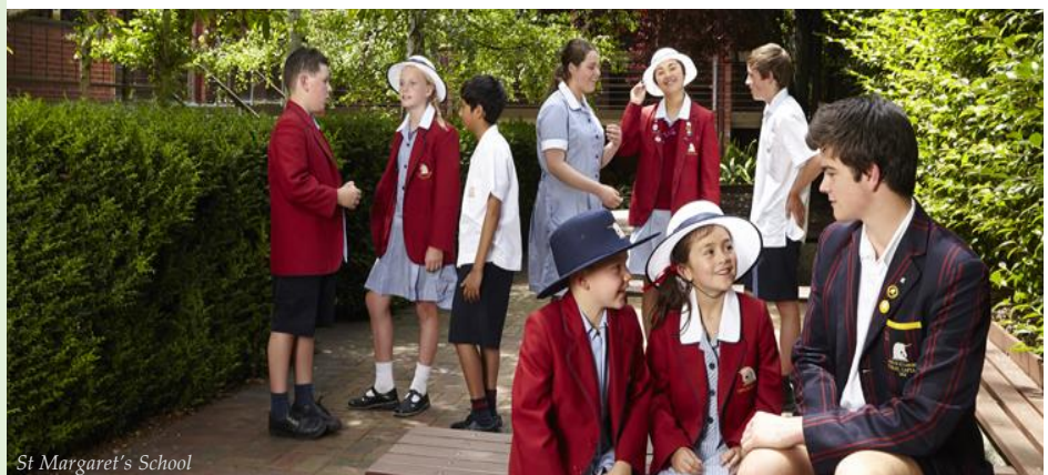
St Margaret's School