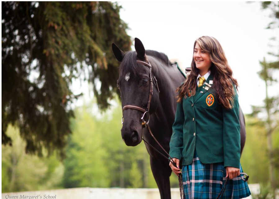
Queen Margaret's School

With a united voice, FISA Advocates for Parental Choice, Recognition and Funding; Supports Independent School Associations in Their Pursuit of Excellence; Strengthens Educational Practice; And Contributes to the Public Good.